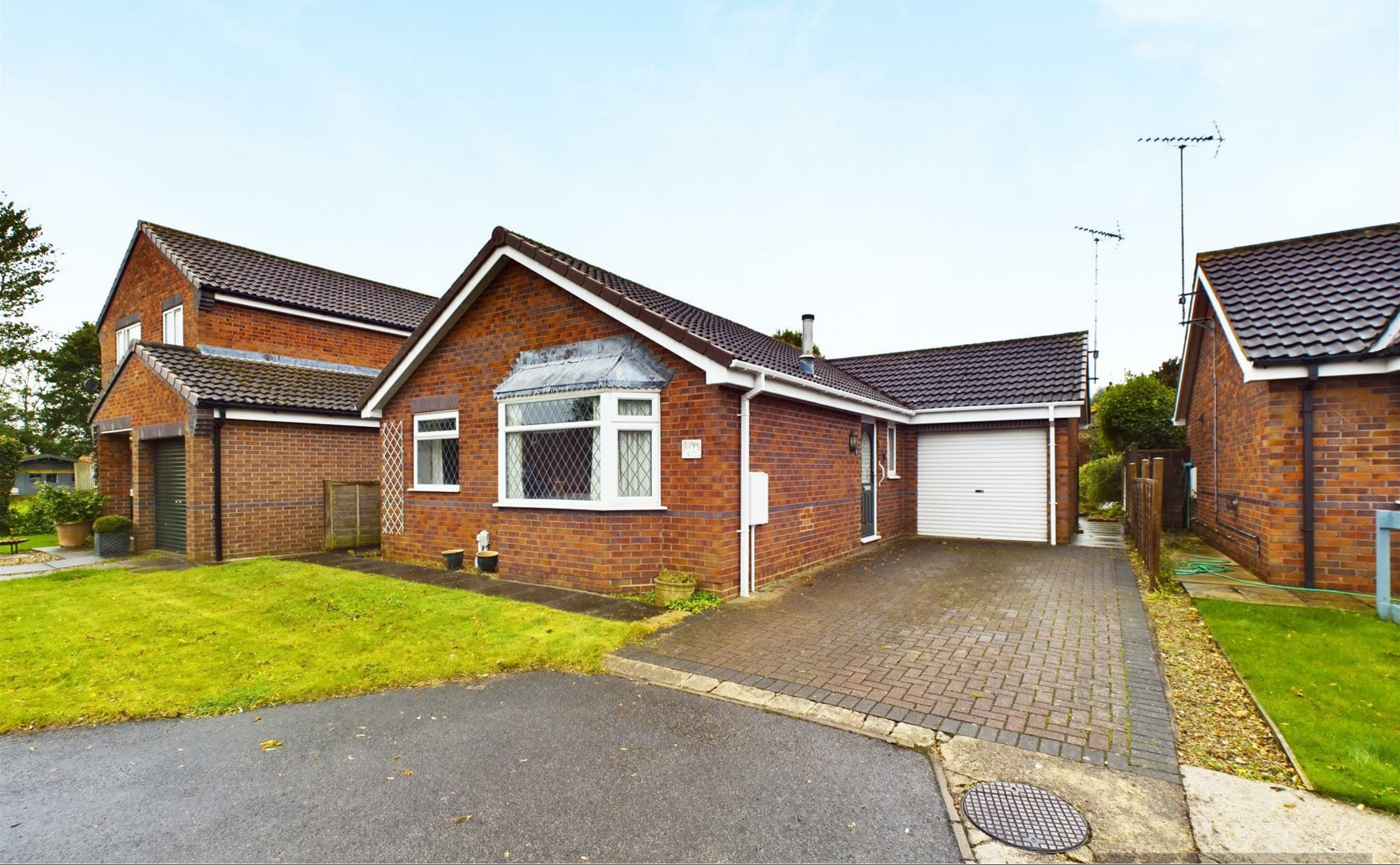
29 Oaklands Cranswick, Driffield, East Yorkshire YO25 9RN Guide price £225,000